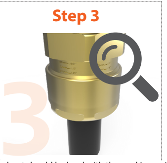
The backnut should be level with the marking guide corresponding to its diameter – this can be visually inspected and adjusted as necessary