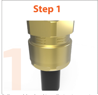
Follow cable gland installation instructions until final stage – tightening of rear seal

The gland is permanently marked with various lines/numbers indicating the correct tightening level related to the cable diameter. Following the relevant cable gland Installation Instructions, the back seal should be tightened until a seal is formed on the cable outer sheath and then tightened one further turn.