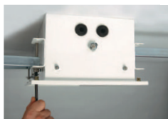
Adjust to ensure ceiling integrity