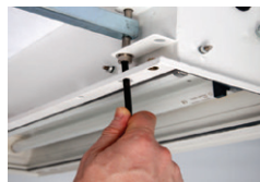
Single screw height adjustment