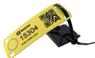
TRANSIT ID KIT 100-PACK

🕒 Practical tools to simplify inspection of transits