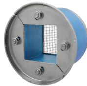
R 100 AISI316