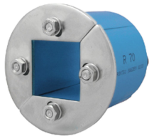
R 70 AISI316