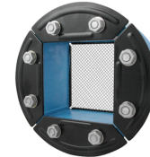
R 150 GALV WITH NET